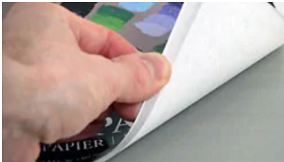
Your Guide to Choosing the Perfect Paint Palette

Choosing the right paint palette is one of the most important decisions you'll make as an artist. It's where your paints live, mix, and come to life—ready to burst onto your canvas. But with the wrong palette, your paints can dry out or become a mess