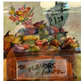
DeMartini Orchard