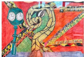
Los Altos Art Sculptures by Charlotte Montgomery