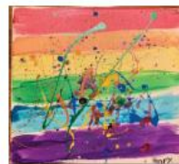
Henry Artiles-Hoang Drawing and Painting Weekend 3