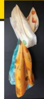
Rajashree Dokras Handprinted Silk Scarves, Art Prints www.RajashreePrints.com Weekend 3